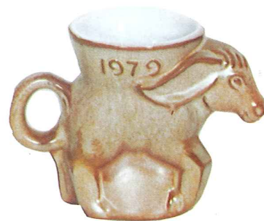
1979 DONKEY MUG

AVAILABLE IN 1979 COLOR: BROWN SATIN 5 OZ. COFFEE MUG—4.00 EACH