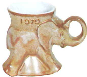
1979 ELEPHANT MUG

AVAILABLE IN 1979 COLOR: BROWN SATIN 5 OZ. COFFEE MUG—4.00 EACH